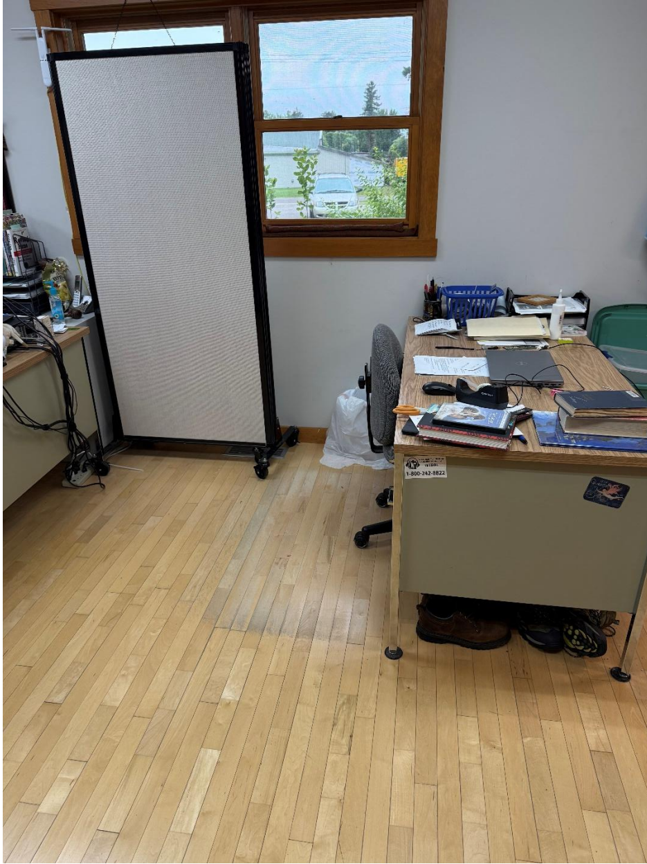
Photo #2: Main Office Damage. Scuff marks under rolling chairs at both desks.