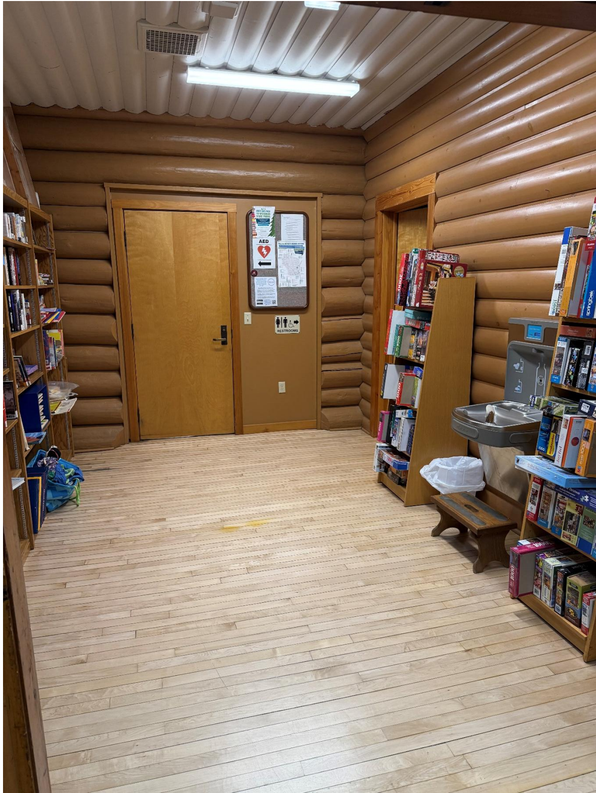
Photo #10: Used Book Room. Yellow discoloration in center of room.