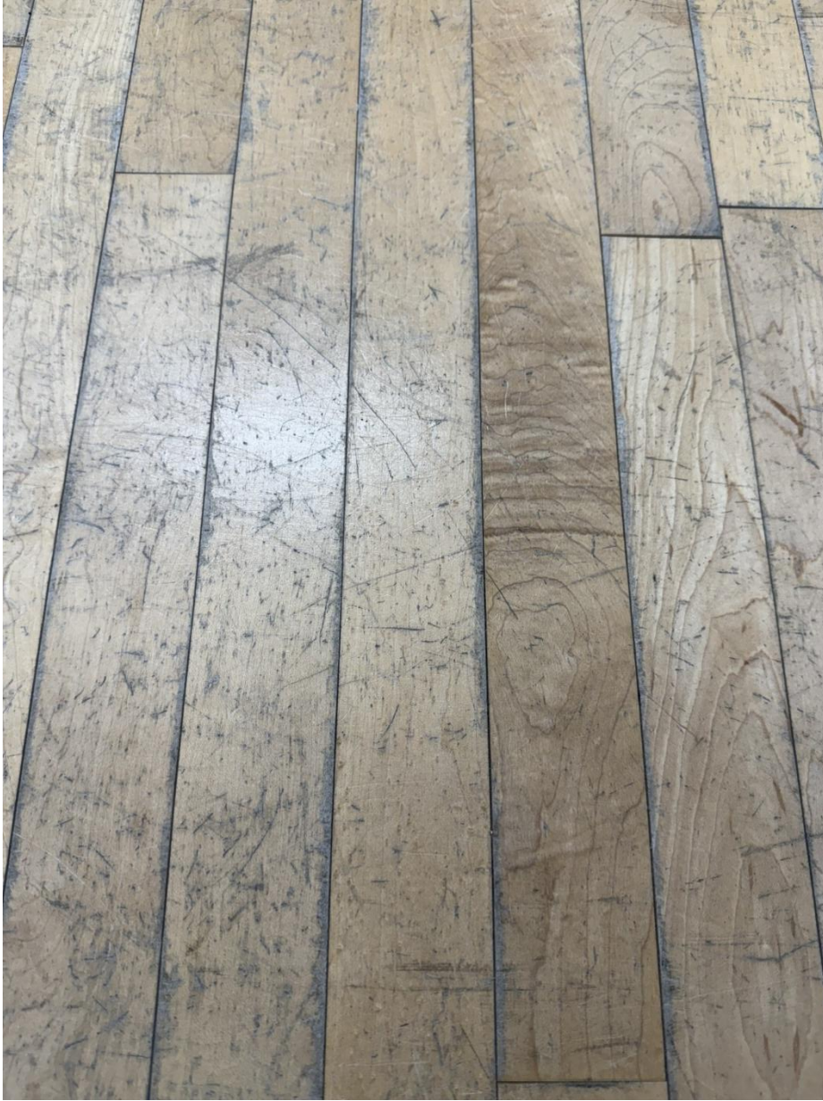
Photo #5: Meeting Room Damage. Close up of sample of scuff mark damage.