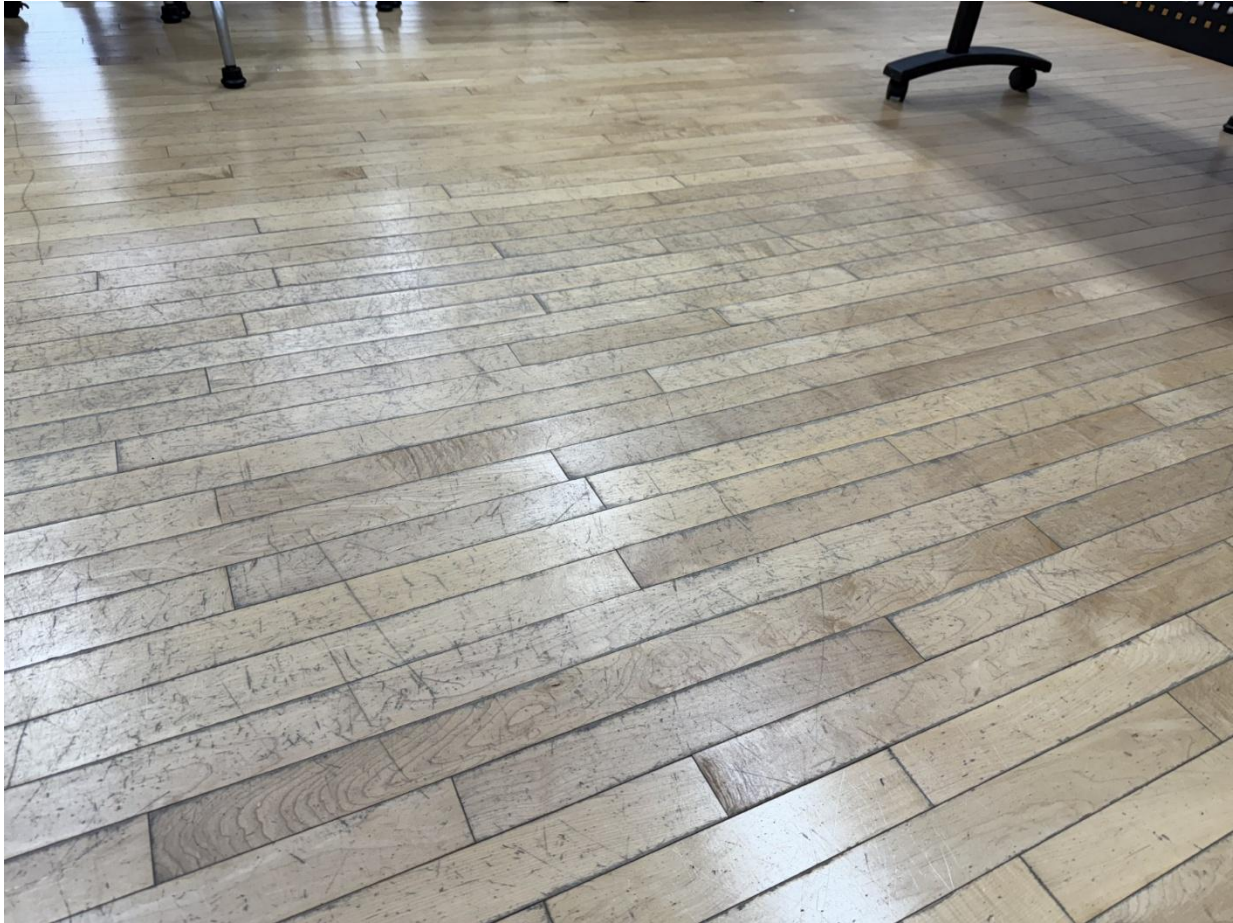
Photo #4: Meeting Room Damage. Scuff marks on majority of flooring.